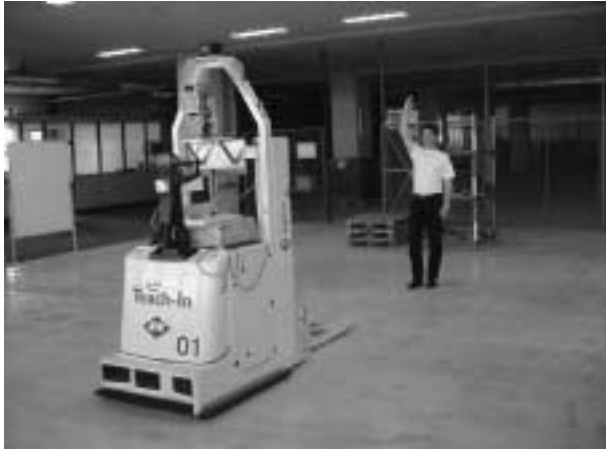
Figure 4: Initial learning of an workshop model by our autonomous robot platform—starting the learning procedure by significant gestures and following the human for learning.