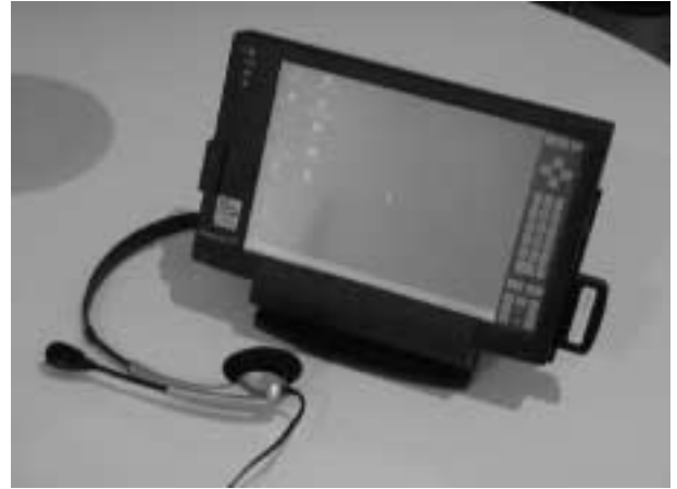
Figure 2: Pentop with headset serving as portable MMI for the Manufacturing Assistant.