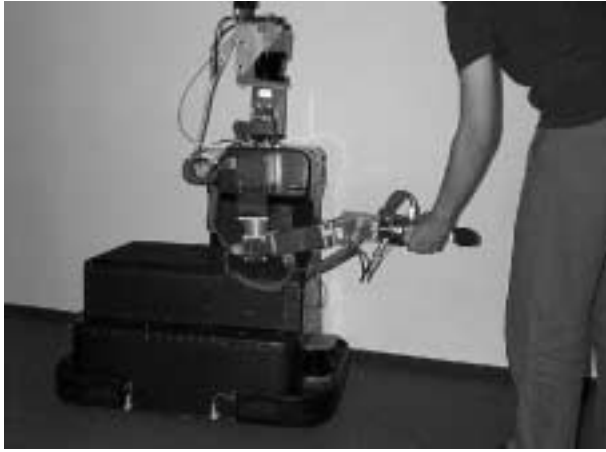
Figure 7: The Service Robot “Clever” at Daimler-Chrysler Research and Technology, Berlin.

evant part out of a 3D point cloud acquired by the 3D laser-scanner. These models are e.g. appropriate for use with the ICP algorithm [2].