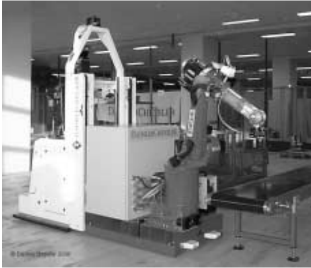
Figure 1: Manufacturing Assistant at Daimler-Chrysler Research Berlin.

receiving or actively requesting information from the human (the latter could for example be in the case where the robot detects ambiguities which it cannot autonomously resolve).