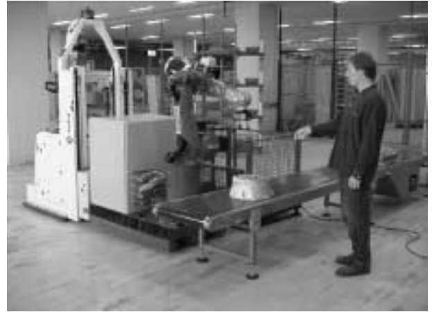
Figure 5: The worker is pointing out objects directly in the scene using a laser pointer.

The general idea we pursue for interactively teaching objects is to let the operator point out the relevant objects/features either directly in the world (e.g. by using a laser-pointer, see Figure 5) or in a graphical interface showing the relevant (possibly pre-processed) sensor data. In Figure 6 is shown an example of teaching objects to be grasped from a conveyer belt using