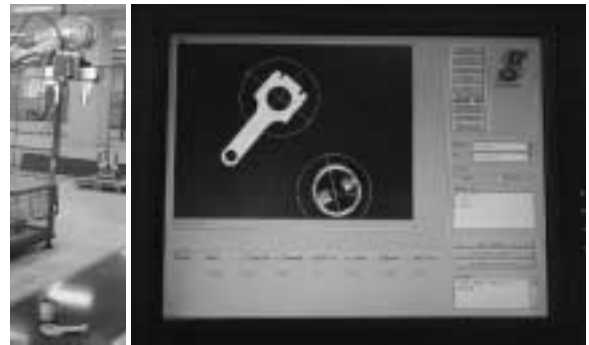
Figure 6: Manufacturing Assistant: learning objects. Left the scene with the manipulator looking down on the conveyer belt with the objects. Right the GUI used to teach the objects.

a gripper camera. With this system, developed by Graphikon GmbH as a part of the MORPHA Project, the user simply places the relevant objects under the camera a few times, showing various examples (of the same aspect). For each example, the object is pointed out in the image (in the teaching phase, objects have to be non-overlapping) and at the end, when sufficient examples have been taught, a grasping position is defined. This is quite intuitive and has been proven to work very reliably under real world conditions.